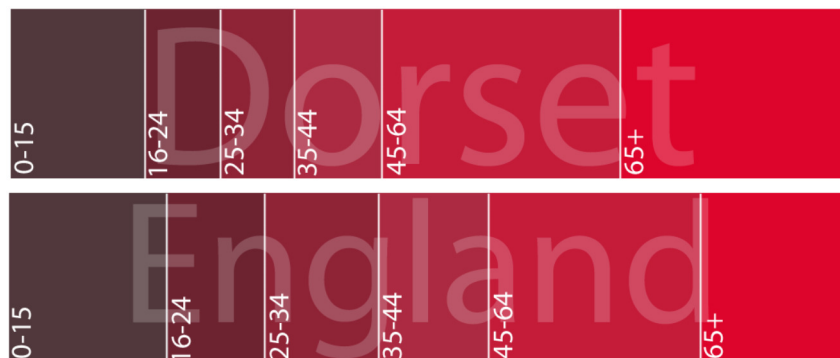
Age profile 2016