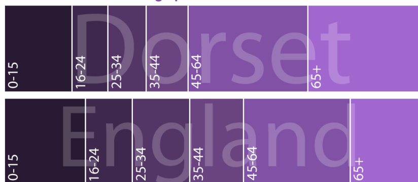
Age profile 2017